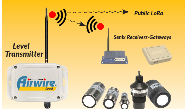
Works with any ToughSonic® Standard or CHEM RS-485 interfaced sensor

The level transmitter conserves battery energy by periodically turning the sensor on to measure, then turning the sensor off and reporting the result.